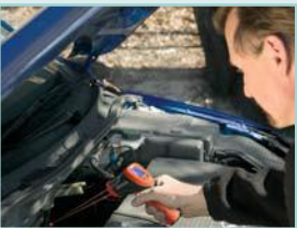
Max hold indicates and holds the peak temperature for easy identification of hot spots