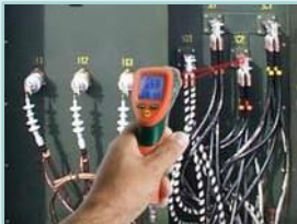
Fast response captures hot spots