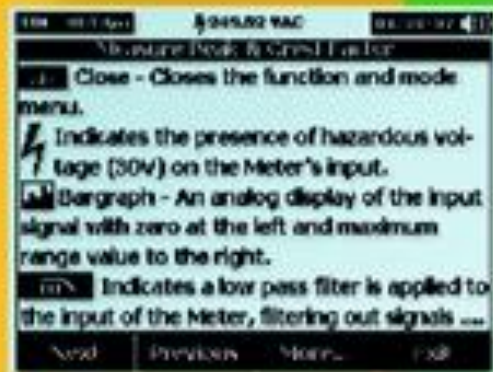
"i" button provides instant on-screen help