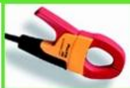
i400 Current Clamp