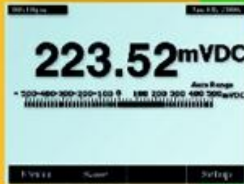
0.025 % basic dc accuracy allows you to measure with confidence.