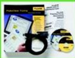
FlukeView® Forms and Cable

A wide array of accessories is available to help you maximize the productivity of the Fluke 289 but the following are essential for most users.