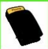
C781 Soft Meter Case