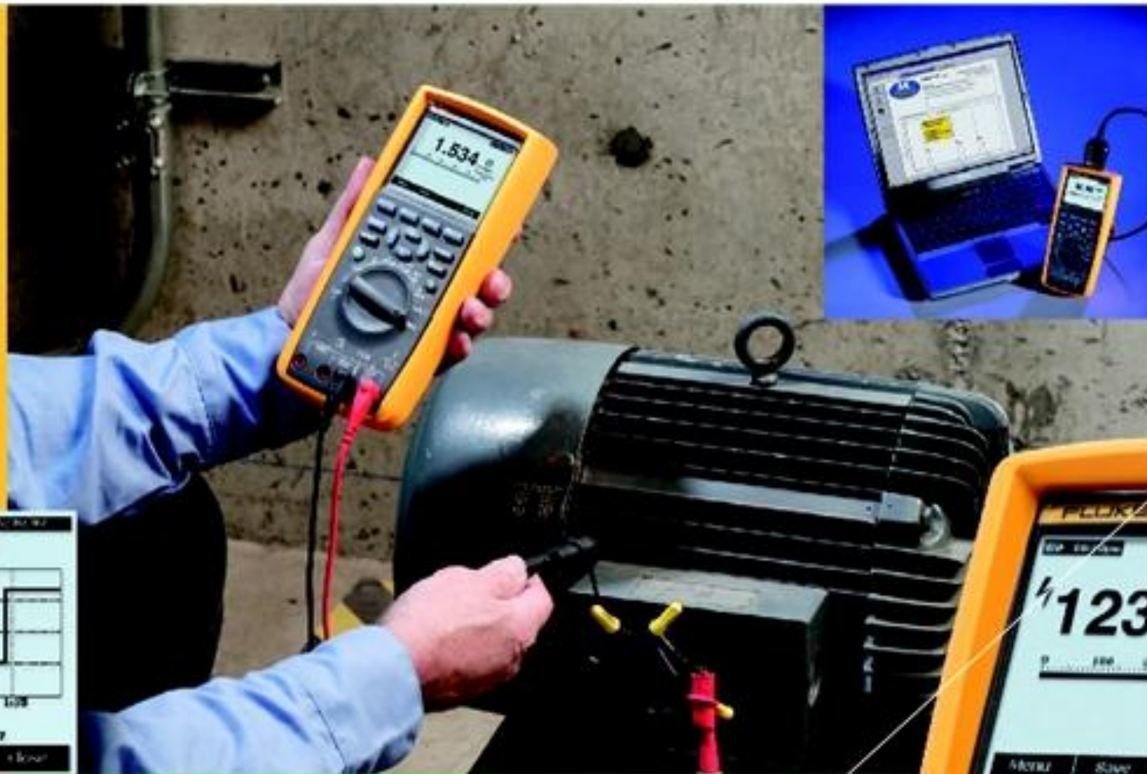
Transfer data to PC using optional cable and FlukeView Forms Software