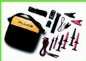
TLK289 Electronic Test Lead Kit