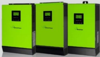
InfiniSolar V-1K-12 InfiniSolar V-2K-24 InfiniSolar V-3K-48 InfiniSolar V-4K-48 InfiniSolar V-5K-48